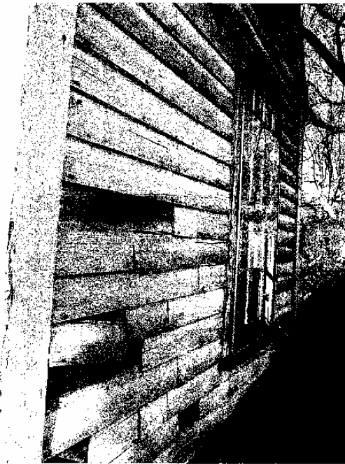
1-3 Right Side Wall