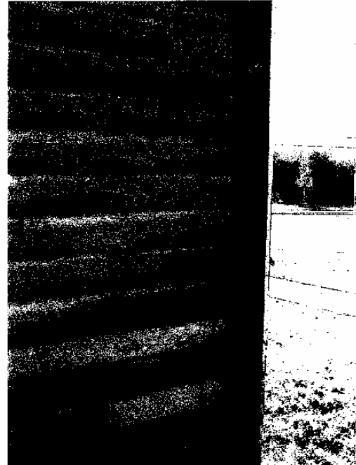
1-2 Rotted Corner Beam