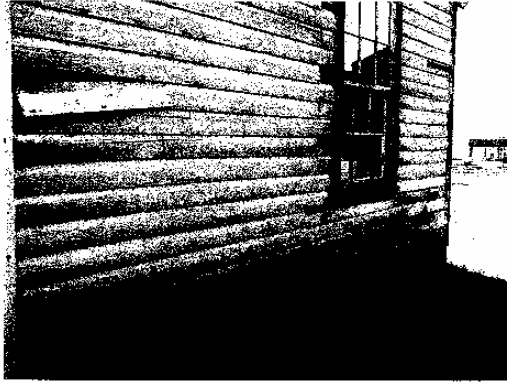
1-1 Back Wall